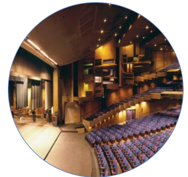
Zellerbach Auditorium, UC Berkeley, California