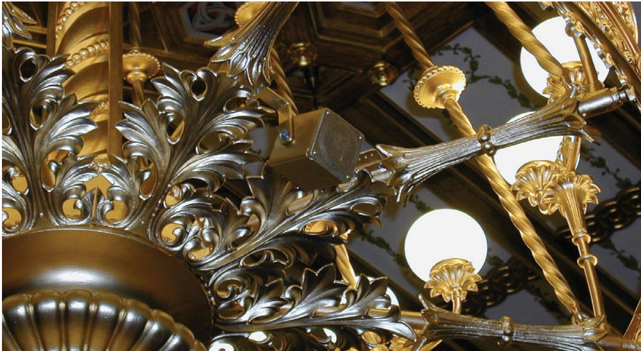
Norway's Parliament Building Stortingssalen, Oslo, Norway

“ Performing at Zellerbach Hall with the (Meyer Sound) Constellation system, one can deeply appreciate how far technology and science have developed. The hall's acoustics come to life in response and one can tell that the audience and musicians are having a new and extraordinary experience.