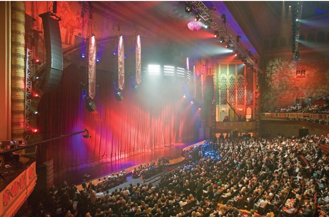
Shrine Auditorium, Los Angeles, California