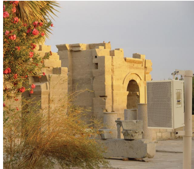
Philae Temple, Aswan, Egypt