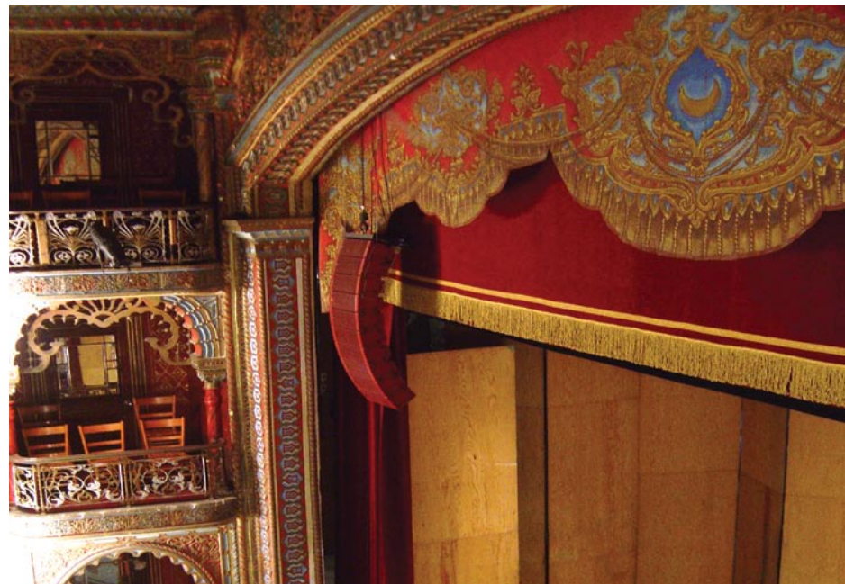
Teatro Juárez, Guanajuato, Gto., Mexico

T: +52 55 5631.8137 F: +52 55 5630.5391 mexico@meyersound.com www.meyersound.com/spanish