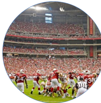
Cardinals Stadium, Glendale, Arizona