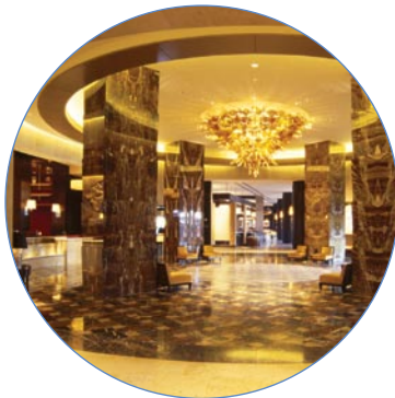
Hilton Americas, Houston, Texas