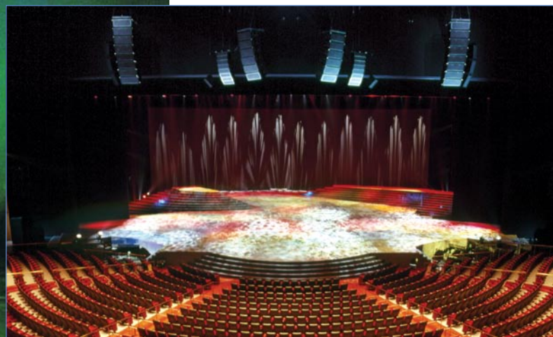
The Colosseum at Caesar's Palace

Wicked , The Lion King , Kiss Me Kate , Man of La Mancha , Les Miserables