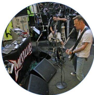
Metallica, Rehearsal Studio

Sound Designer Cirque du Soleil® (Corteo, Mystère, Saltimbanco, La Nouba, “O”, KÁ, ZUMANITY), Ragtime, Seussical, Lestat, The Pirate Queen