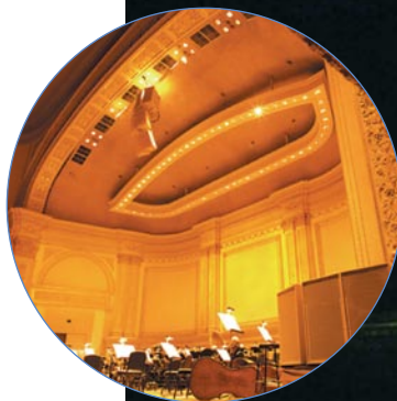
Carnegie Hall New York