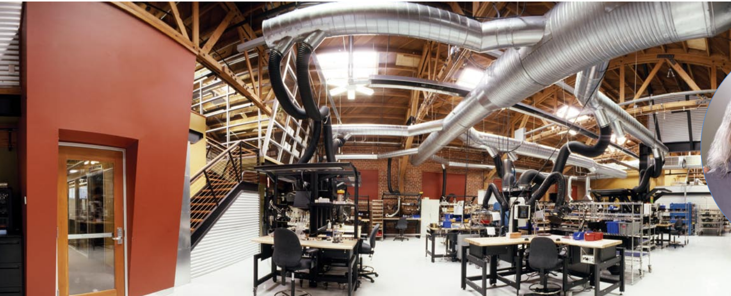
Saturn Driver Manufacturing Facility